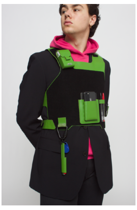
BULLETPROOF VEST Leather and Webbing utility vest 2018