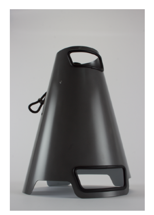
GENIO Multifunction lamp for every home 2018

My interests vary from conceptual art to physical science such as engineering. Most of my current work is formed around the human, its body and its interaction with the surrounding world, such as my first solo exhibition "The World As We Know It" held at the European Court of Justice (Luxembourg).